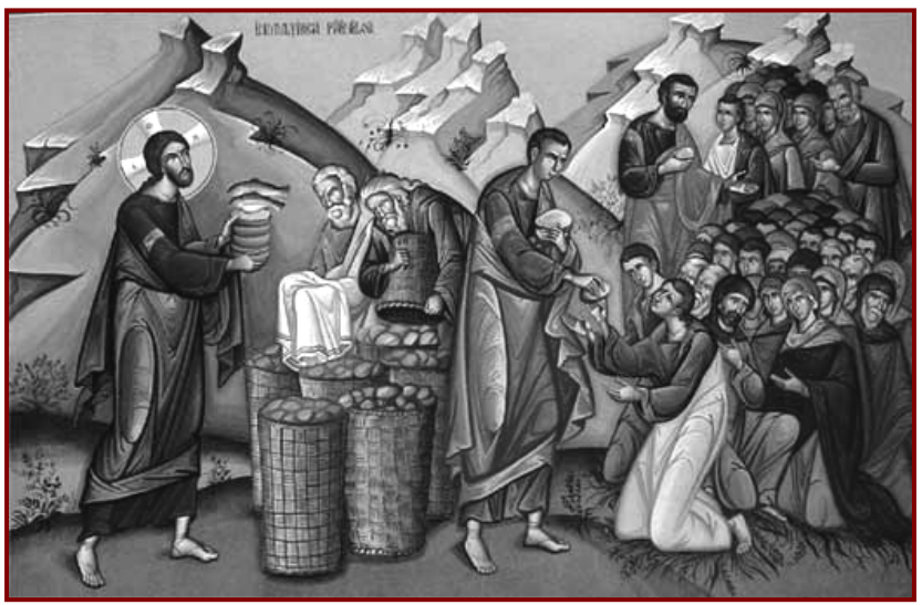
JESUS FEEDS THE MULTITUDES If we offer what we are able, God will multiply our offering.

Effective stewardship ministry is going out to our people wherever they are in their walk with Christ, helping them to realize their importance as members of the Body of Christ, encouraging them to offer their gifts in His service. We use various resources to support our efforts, but unless we meet with our people face-to-face, sincerely listen to their ideas and concerns, and share a vision for the future of the parish, our efforts will not each their full potential.