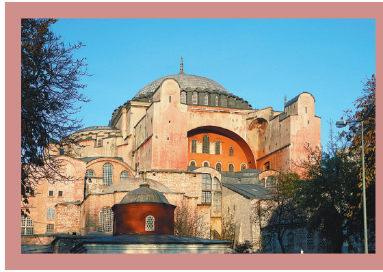
The Church of Hagia Sophia in Constantinople was the Cathedral of the Ecumenical Patriarchate for over one thousand years.

Greece, Poland, Albania, and the Church of the Czech Lands and Slovakia. The Autonomous Churches include those of Finland and of Estonia. Consequently, the Orthodox Churches in Europe, North and South America, Australia, Asia, and Britain, which are not under the jurisdiction of the aforementioned autocephalous Churches, are within the jurisdiction of the Ecumenical Patriarchate. It is a true sense of unity in diversity.