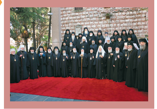
Synaxis of the Heads of the Orthodox Churches at the Phanar in October 2008

From that time, the Ecumenical Patriarchate became a symbol of unity, rendering service and solidarity to the Eastern Churches. The Ecumenical Patriarchate was consulted for the resolution of disputes between the Churches. Frequently, patriarchs of other Churches would reside in Constantinople, which was the venue for meetings of the Holy Synod that was chaired by the Ecumenical Patriarch. With the rise of nation-states in the Balkans and the collapse of the Ottoman Empire in the late nineteenth and early twentieth centuries, the Patriarchate has overseen the development of the Orthodox Churches in those lands.