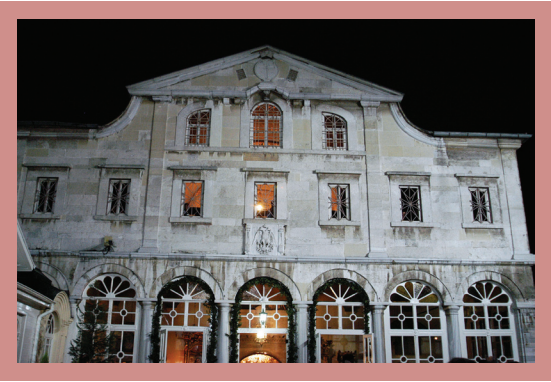
The Patriarchal Cathedral of Saint George at the Phanar

The Ecumenical Patriarchate is a dynamic leader in ecumenical dialogue and the reconciliation of Christians. Since the 1960’s, it has been in dialogue with the Oriental Orthodox Churches (Armenian, Coptic, Ethiopian, etc.), working to heal the divisions of the oldest Christian division, which dates from 451. The Ecumenical Patriarchate has fully participated in the work of the World Council of Churches from its inception, as well as in local ecumenical bodies instituting and chairing bilateral theological dialogues with non-Orthodox Christians and also with other monotheistic faiths.