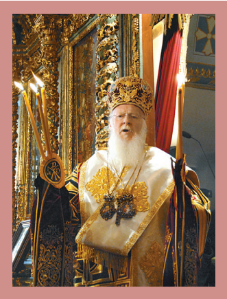
His All Holiness Bartholomew Archbishop of Constantinople and Ecumenical Patriarch

Ecumenical Patriarch Bartholomew has visited Muslim nations, previously never visited by Christian heads of Churches, advocating religious tolerance, freedom, and peace among all religions. Moreover, his pioneering initiatives for the preservation of the natural environment have earned him the title “Green Patriarch.” He organized five environmental seminars in co-sponsorship with His Royal Highness Prince Philip (1994-1998). He also established the Religious and Scientific Committee, which has organized seven international, interfaith and interdisciplinary seaborne symposia to date: Patmos and the Mediterranean (1995), the Black Sea (1997), the Danube River (1999), the Adriatic Sea (2002), the Baltic Sea (2003), the Amazon River (2006), and the Mississippi River and Gulf Coast (2009).